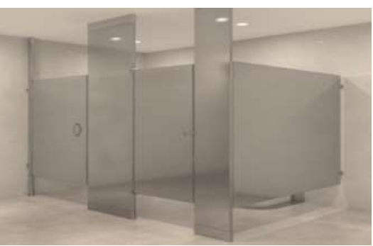
Floor to ceiling