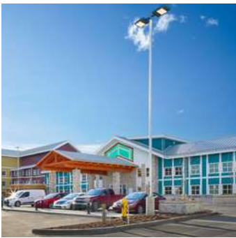
Whistle Bend, Whitehorse Yukon