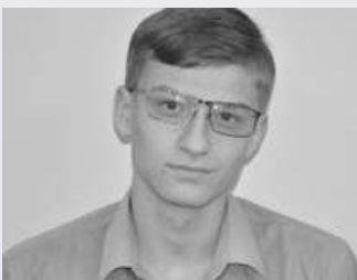
Lanny Pittman Production/Installation