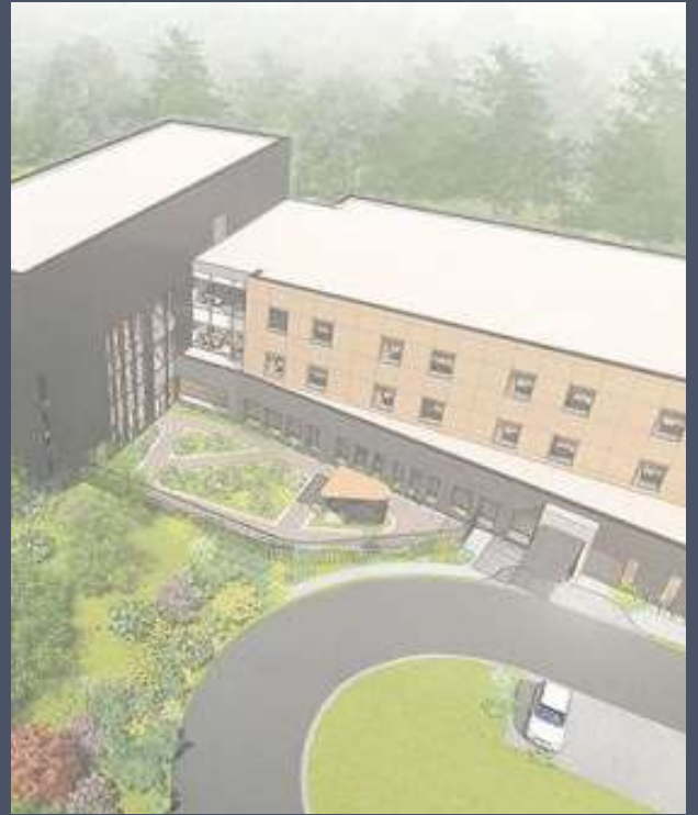
Gander and Grand Falls Long Term Care, Windsor NFLD