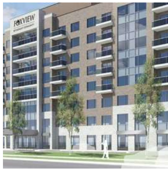
Claridge Foxview Retirement Community, Ottawa