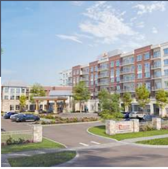
All Seniors Care Aspen Heights, Calgary AB