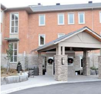
The Windsor Retirement Residence, Kingston ON