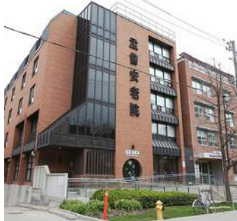
Mon Sheong, Toronto ON