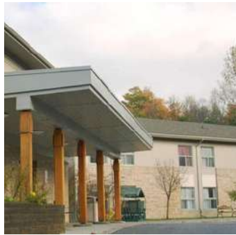
Revera Montfort LTC, Ottawa