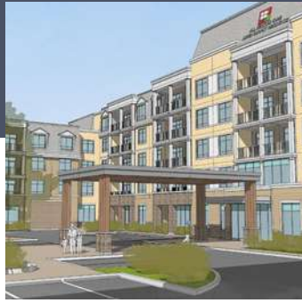
All Seniors Care Cataraqui Heights, Kingston ON